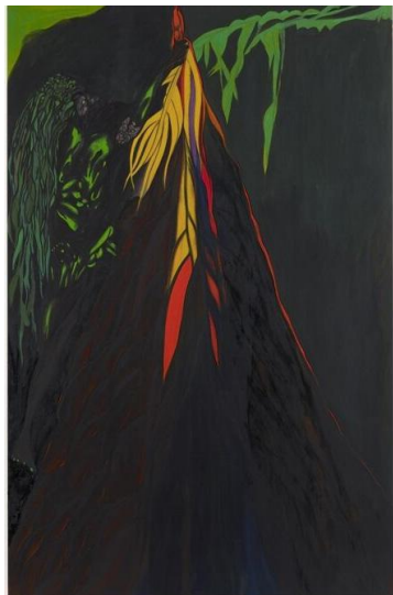
Chris Ofili, Habito Green Locks , 2009