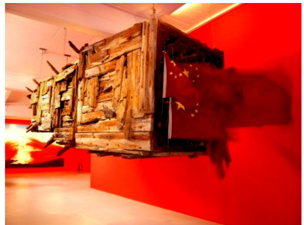
Cai Guo-Qiang, The Dragon has Arrived , 1997

“The living being had no need of eyes when there was nothing remaining outside him to be seen; nor of ears when there was nothing to be heard; and there was no surrounding atmosphere to be breathed; nor would there have been any use of organs by the help of which he might receive his food or get rid of what he had already digested, since there was nothing which went from him or came into him: for there was nothing beside him. Of design he was created thus, his own waste providing his own food, and all that he did or suffered taking place in and by himself. For the Creator conceived that a being which was self-sufficient would be far more excellent than one which lacked anything; and, as he had no need to take anything or defend himself against any one, the Creator did not think it necessary to bestow upon him hands: nor had he any need of feet, nor of the whole apparatus of walking; but the movement suited to his spherical form was assigned to him; and he was made to move in the same manner and on the same spot, within his own limits revolving in a circle. And as this circular movement required no feet, the universe was created without legs and without feet.” Plato, Timaeus , 33c – 34a