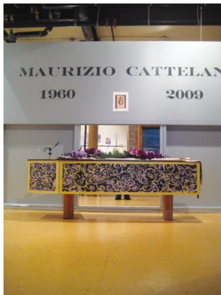
Triple Candy, Maurizio Cattelan is Dead: Life & Art, 1960 - 2009, 2009