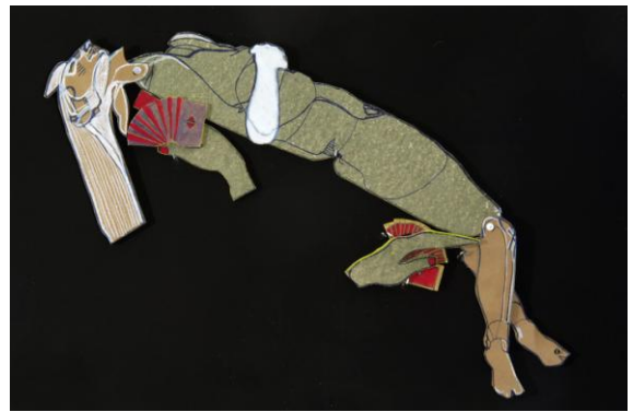
Anastasia Douka, FLIPPERS FAMILY 1 , 2008

Anastasia Douka examines human procedures, along with whichever model of knowledge or retransmission of information, and their products: architectural elements and geographical models, ancient cultures and contemporary popular icons, precious and everyday objects, human anatomy and machine anatomy, fantasies and theories with their proofs. She constructs condensed objects out of joint that carry on different layers elements of the above. Hollow dies of familiar objects and symmetric wood fold-outs come together into a new unit. Every unit is after the hard-hidden gold in the bowels of the earth, the way adventurers do it.