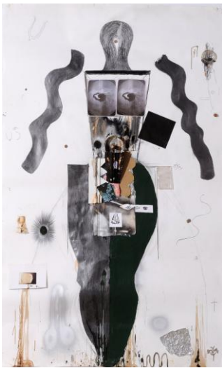
Jannis Varelas, Untitled , RHP/Venice 812, 2010

The work of Jannis Varelas is defined by the pursuit of sets of historical references, with the purpose of recomposing and redefining them through new apperceptions. The artist is interested in the exploration of mechanisms that produce meaning within human perception, as well as the ways that meanings correlate, shift or collapse within human psychological state. In addition, he is also interested in the mechanism of self-definition resulting from every person's own mythologies. This searching directs Varelas every time in the use of different materials and media, like drawing, collage, video, sculptures.