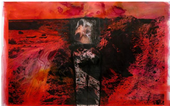
Huma Bhabha, Red Desert , 2010

WWW . DESTE . GR T — 30 210 27 58 490 F — 30 210 27 54 862